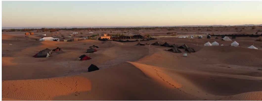
OCT 2017 Bivouac Le Petit Prince