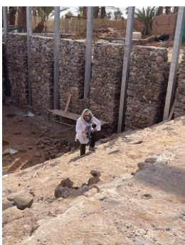
Climbing amphitheater steps